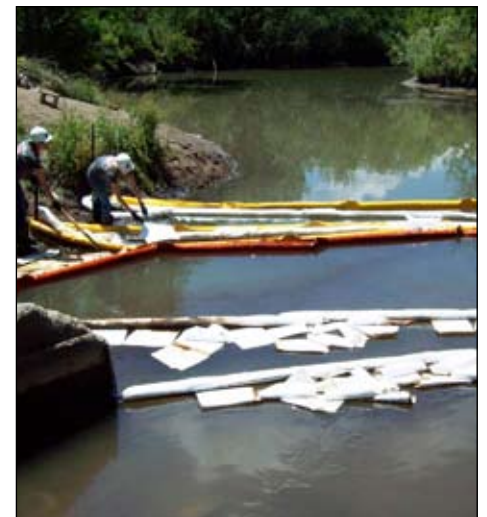
Booms placed in the Jordan River soak up oil flowing in from the Red Butte Creek spill, June 2010.

For more information about the spill and the response, including specific monitoring and sampling data, go to www.deq.utah.gov/Issues/redbuttespill/index.htm#top □