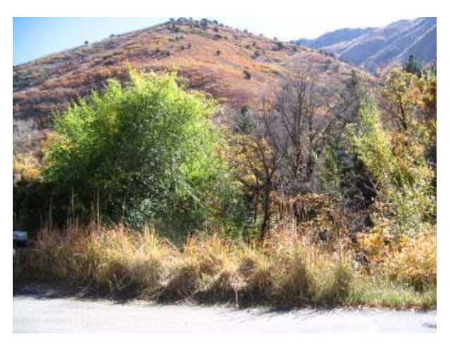
Emigration Canyon, Upper Emigration Creek Sub-Watershed