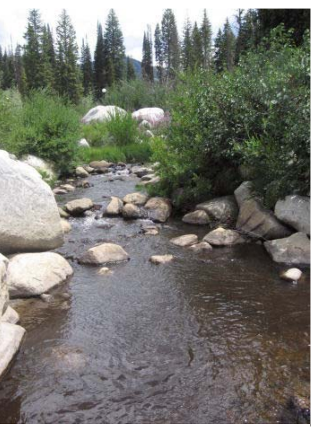
Big Cottonwood Creek, Upper Big Cottonwood Creek Sub-Watershed

Key to WaQSP implementation is the development of Sub-Watershed plans. Blueprint Jordan River will provide a vital public component that will be used when identifying implementation activities for the Jordan River Corridor Sub-Watershed. This process began during the spring of 2007, and is anticipated to be complete by fall of 2008.