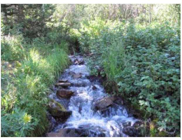
Lambs Canyon Creek, Upper Parley's Creek Sub-Watershed

Little Cottonwood Creek, Segment 2 has the only completed TMDL study in the Salt Lake Countywide Watershed (DWQ, 2002). Dissolved