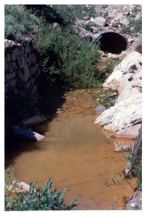
Columbus-Rexall Drainage, Little Cottonwood Creek Sub-Watershed

zinc concentrations in the upper reaches exceeded water quality standards for the designated beneficial use (cold water fishery). Emigration Creek TMDL is currently under development as well as the Jordan River TMDL. Additionally, water quality studies are ongoing for areas of the Great Salt Lake. Although, not technically within the TMDL program, these efforts are integral to watershed planning in Salt Lake County. Therefore, TMDL findings will be integrated into future WaQSP planning and review process.