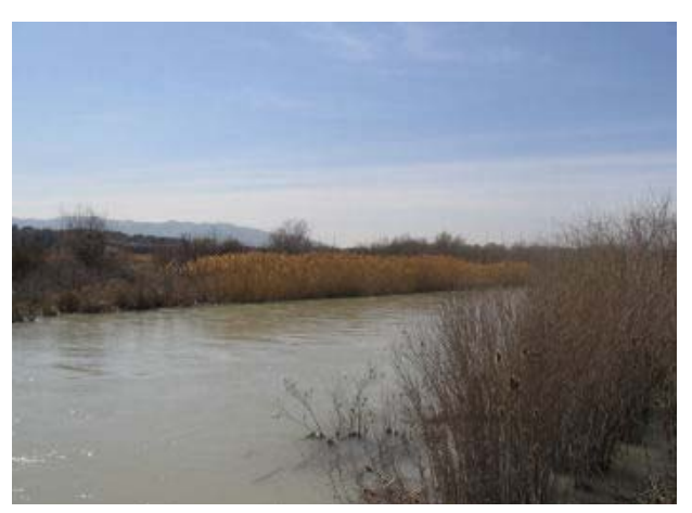
Jordan River, Jordan River Corridor Sub-Watershed