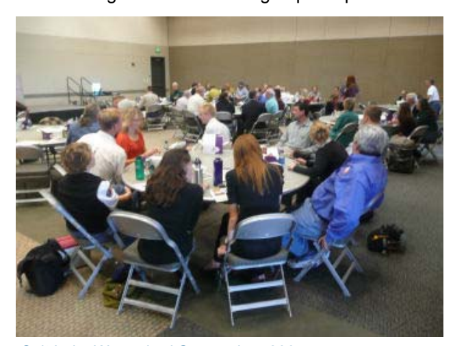
Salt Lake Watershed Symposium 2007

The WaQSP was developed over a three (3) year period with the assistance of Salt Lake County staff, Consulting engineers, and the Jordan River Watershed Council (JRWC). The Plan has been reviewed by numerous stakeholders and presented to the public through: meetings with city officials and the JRWC; presentations to the Council of Governments (COG), Conference of Mayors, Township Planning Commissions and Community Councils: public workshops; newsletters development and distribution at approximately 100 locations; outreach at public festivals/gatherings, and a Countywide Watershed Symposium. Additionally, a Blue Ribbon Panel of local water quality and planning experts was assembled to offer advice on the Plan. Refer to acknowledgements for a listing of participants.