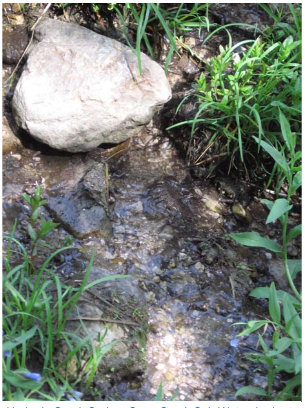
Harker's Creek Spring, Coon Creek Sub-Watershed

In August of 2005, South Valley Sewer District (SVSD) made a request to amend the Area-Wide Water Quality Management Plan. The plan