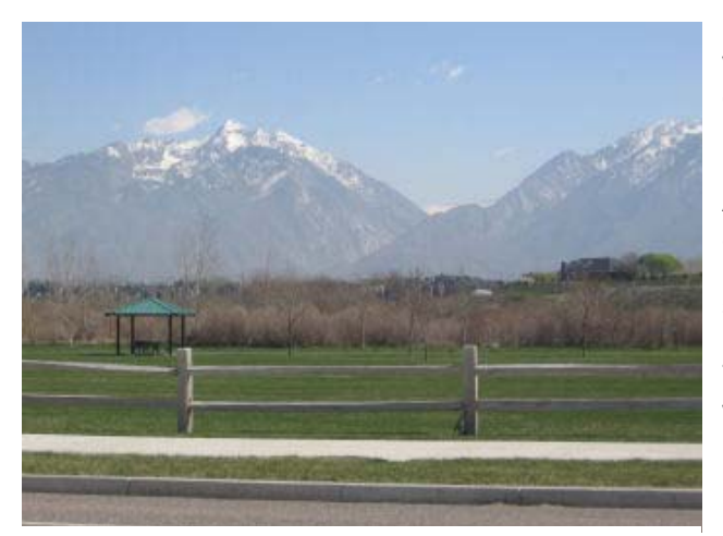
Park adjacent to the Jordan River, Jordan River Corridor Sub-Watershed

As the Jordan River Parkway Trail is one of the most heavily used recreational systems in the County, this effort represents a key opportunity to identify and install recreational facilities that are compatible with environmental resources.