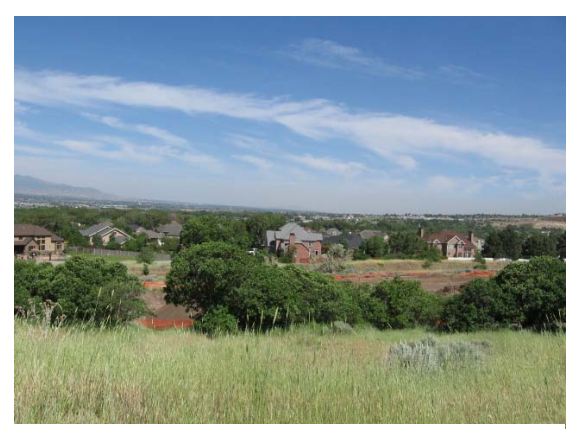
Draper City, Lower Corner Canyon Creek Sub-Watershed