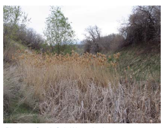
Bingham Creek Sub-Watershed