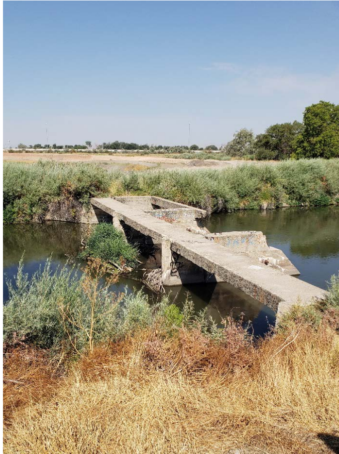
Photo 6: Abandoned bridge structure at about 2700 North should be removed