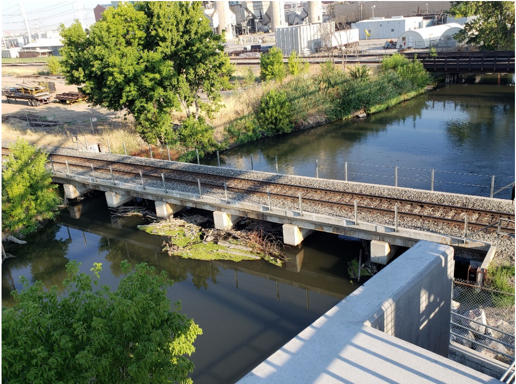
Photo 4: Piers on railroad bridge at approximately 100 South could collect debris