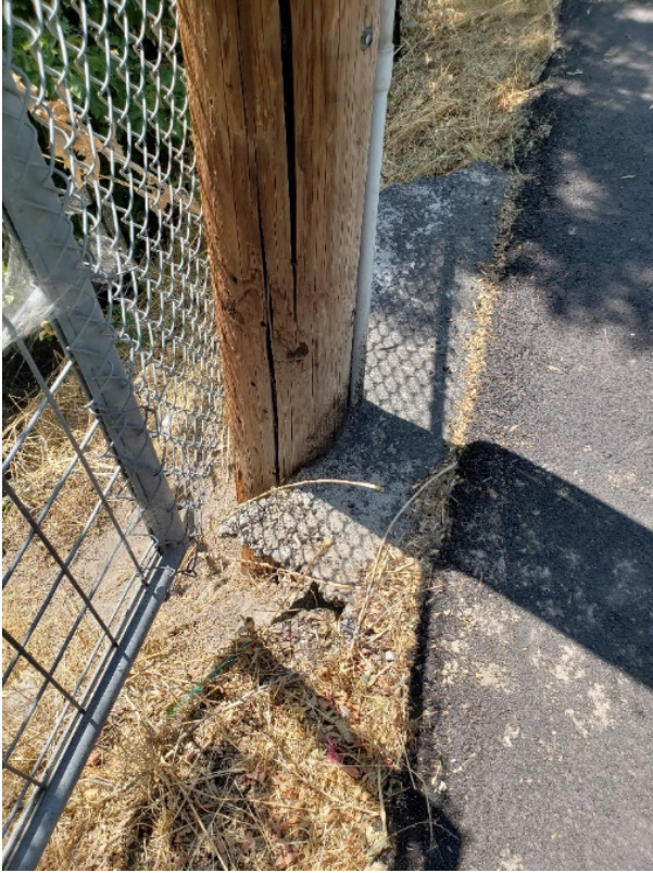
Photo 1: Erosion near a power pole on inside of bank at approximately 1300 South