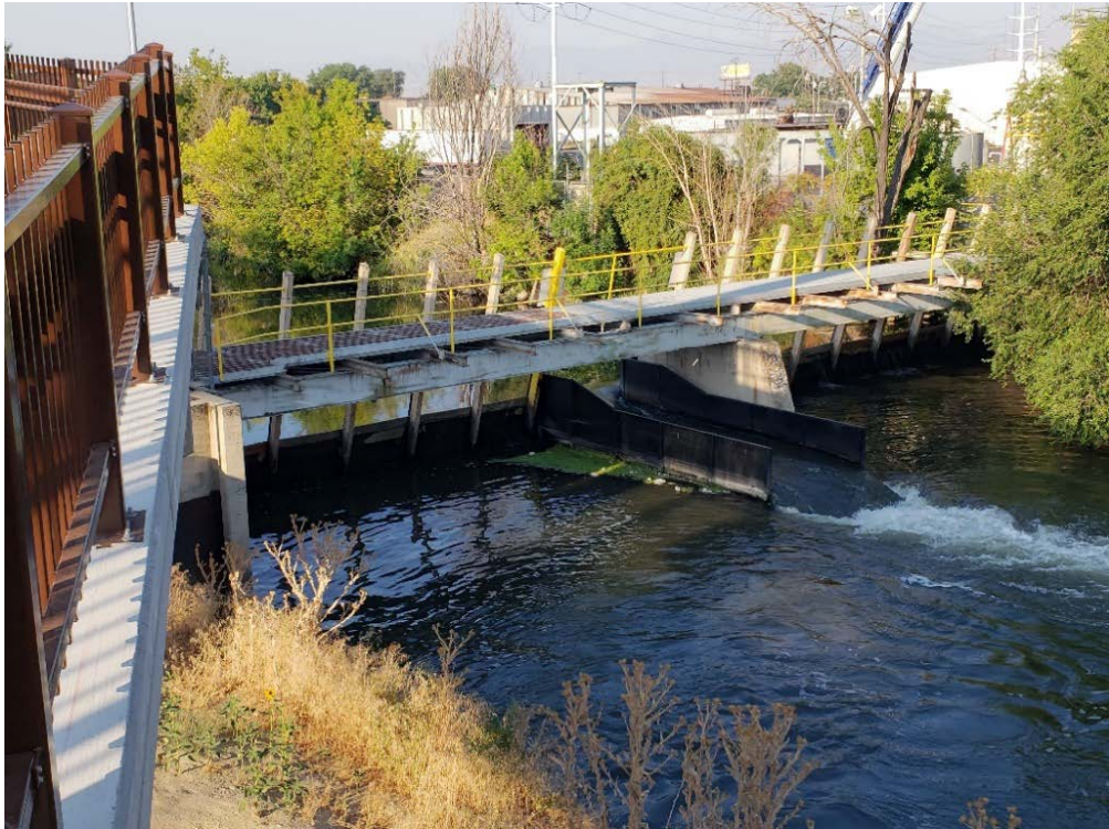
Photo 5: A diversion structure with a canoe passage feature near South Temple has piers that could potentially capture debris