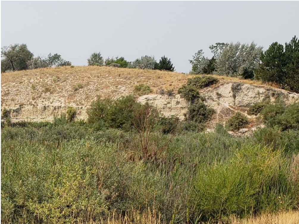
Photo 2: Tall vertical bank just upstream of the bridge at 12600 South