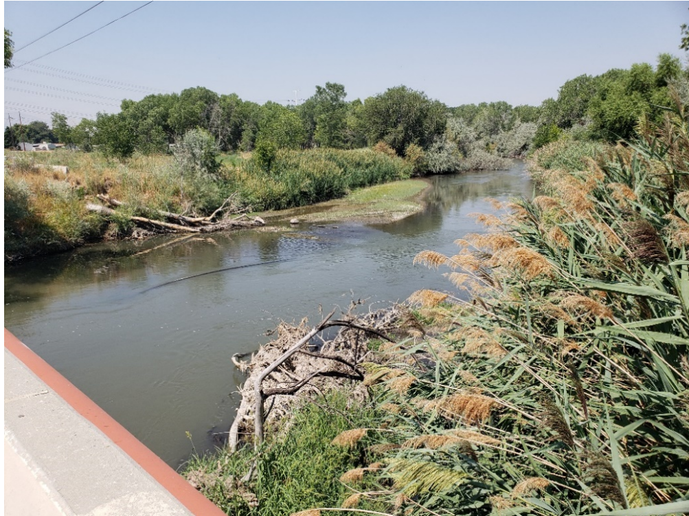
Photo 3: Thick vegetation, fallen trees, and sediment bar at approximately 3900 South.