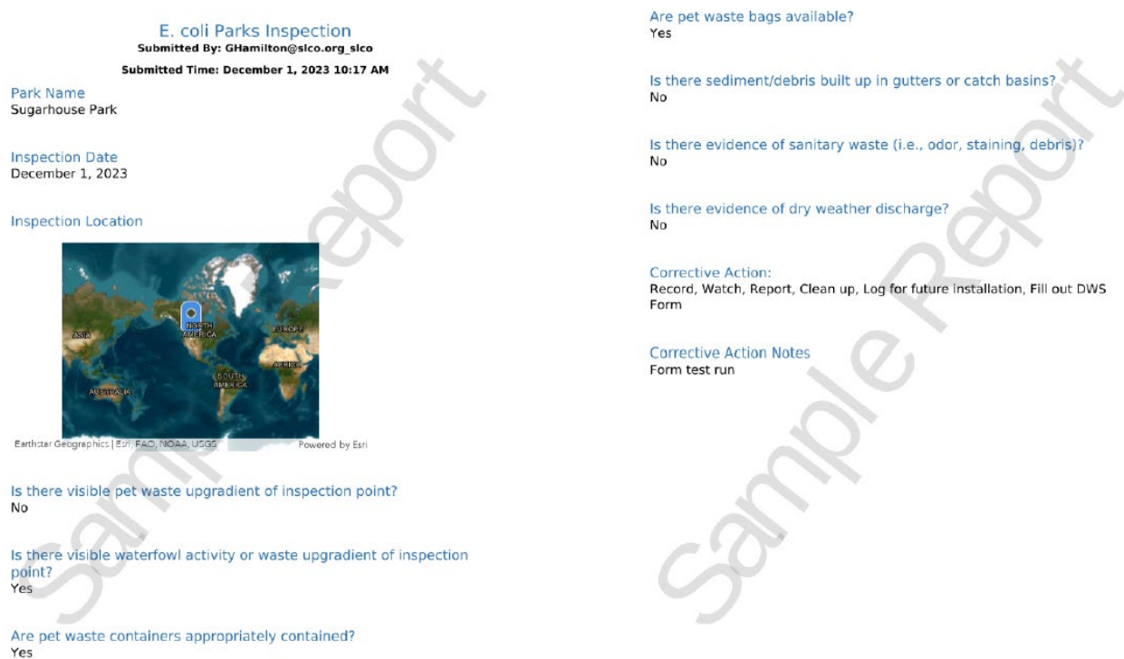
FIGURE 2. SAMPLE IDDE E. COLI PRIORITY INSPECTION FORM

Permit part 3.2.2.2.3 requires SLCo to add priority inventoried areas to the street sweeping and storm sewer system maintenance schedule and identify these areas in County standard operating procedures (SOPs) with the highest priority areas maintained at the greatest frequency.