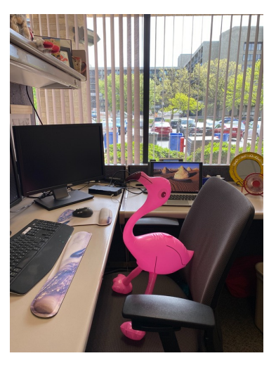
Submitted by Aging & Adult Services

If you'd like to be entered into the random prize drawings, visit the <u>submission form</u> to submit your best photos of Flavia helping out your team. Random prize drawing winners will be announced weekly up until Employee Appreciation Day in June. (<u>Full instructions</u> can be found on the Employee Appreciation Day webpage.)