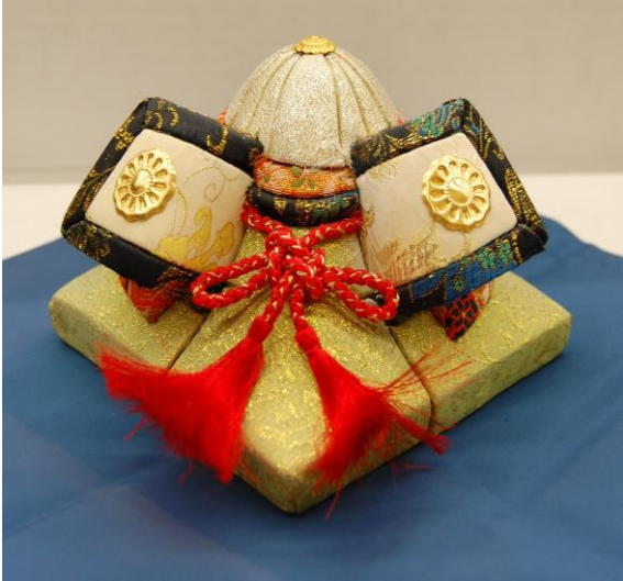
Ceramic and cloth decorative item in square wood presentation box