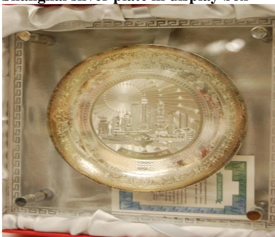
Shanghai silver plate in display box