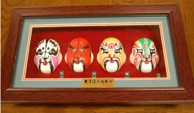
Four Asian ceramic masks in wood display case