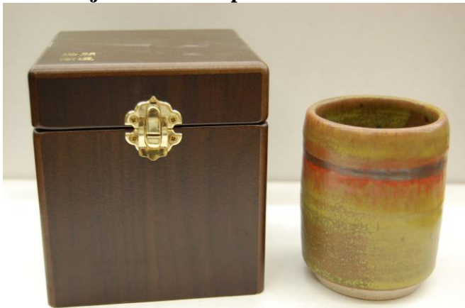
Ceramic jar in wooden presentation box