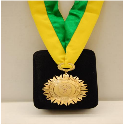
Boxed green and yellow ribbon: “Municipalidad Distrital De Castilla – Medalla Civica.”